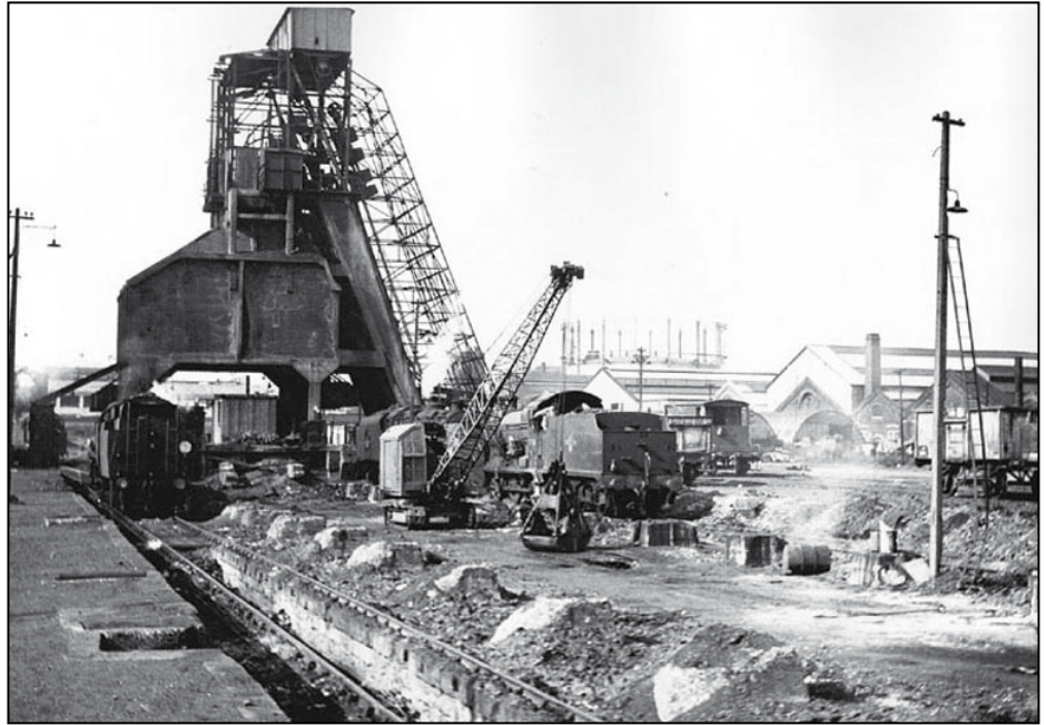
Coal hoppers created dramatic film locations

The coal gas industry declined as the North Sea and other fields for pipeline gas were opened up, and Nine Elms Gas Works closed in 1970. However the gas holders continued to be used for the storage of natural gas – and another structure survived too. It was at this point that I encountered a fellow connoisseur of Battersea's gas industry – the film maker Patrick Keiller, who in 1977 had started to 'collect' what he called 'found architecture' across London... 'structures with striking architectural