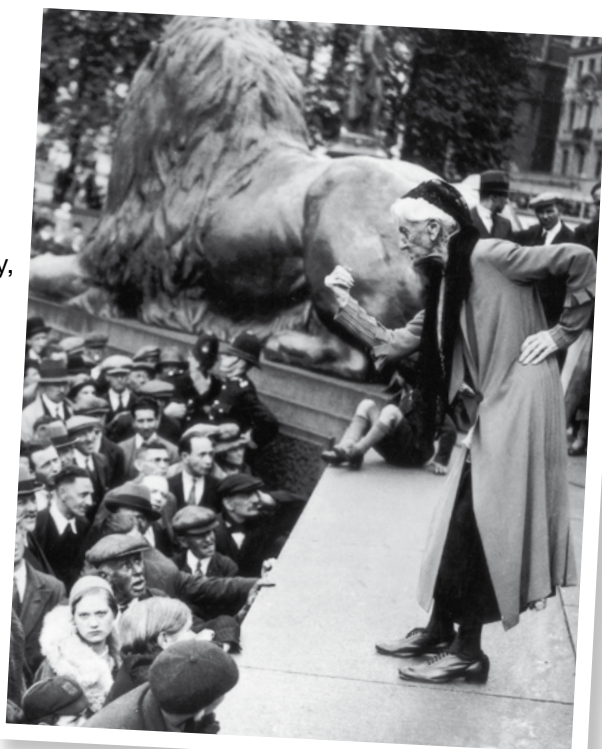
Charlotte Despard on form at an anti-fascist rally in Trafalgar Square, 1933

Despard's last major public appearance was on 12 June 1933, when she spoke passionately at a great anti-fascist rally in Trafalgar Square. At that time, she was aged 89. Her appearance flouted the long cultural tradition which discouraged women from public speaking, let alone from speaking out of doors, without a microphone. For that feminist feat alone, it could be argued that a statue of Despard should stand on Trafalgar Square's vacant