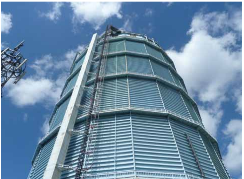
The Blue Man towered over Battersea

First port of call on the demolition was our Society's planning committee, whose view was straightforwardly pragmatic. 'There does not appear to be any barrier to these (gasholders) being demolished. Our input to the planning application will focus on the need to mitigate the effects of