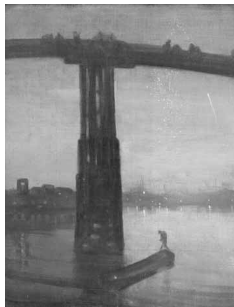
James Abbott McNeill Whistler, Nocturne: Blue and Gold, Old Battersea Bridge