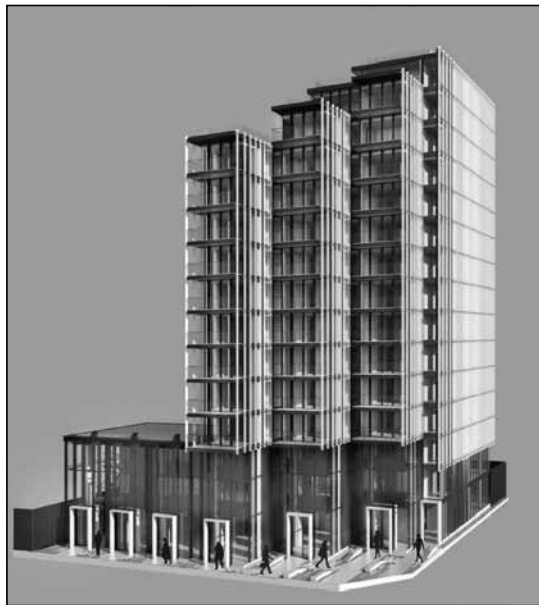
3 Culvert Road. We objected, among many others

There has been less publicity about the fact that the Council is also introducing measures to protect local shops from changes from traditional retail operation to financial and professional services. These include parades within Northcote Road, Battersea Park Road and Battersea High Street. Full details can be found on the Council's website at www.Wandsworth.gov.uk/article4 . Protection for both pubs and shopping parades will not come into force for a year due to the requirement to give adequate notice of the change of policy.